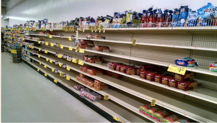
Empty supermarket shelves in Pennsylvania prior to last month's winter storm.