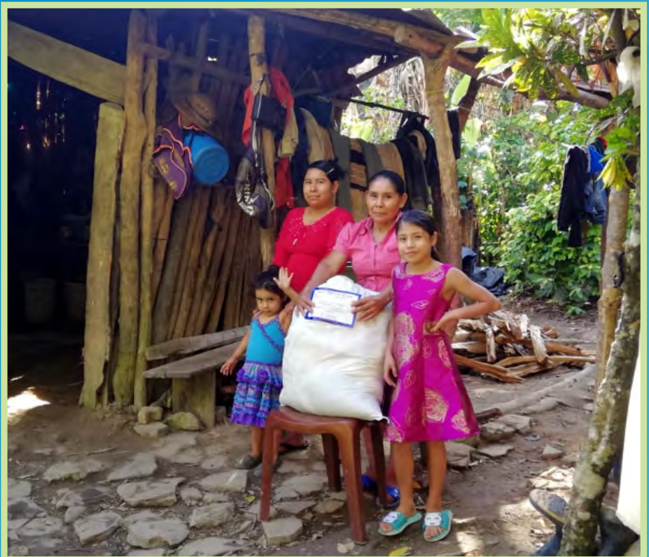
A family from the community of El Cedral, located in the Copán region of Honduras.

Episcopal Relief & Development, in partnership with the Episcopal