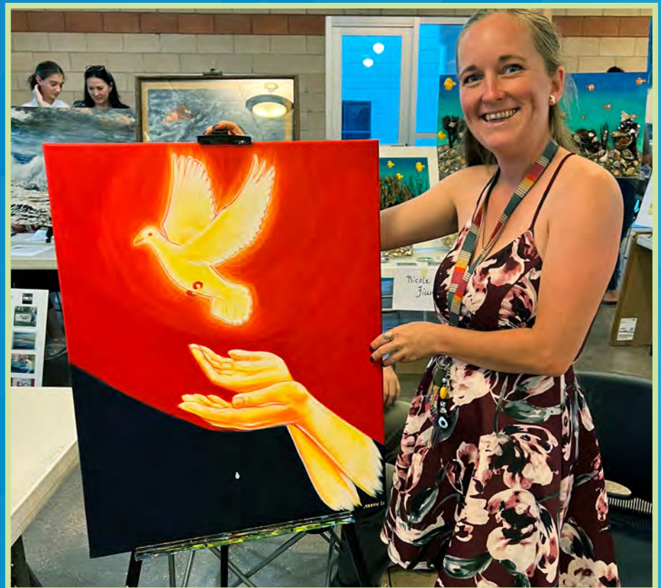
An artist displays her work at The Gathering Place @ St. Michael's.

Grocery stores, places of employment and other frequented spaces